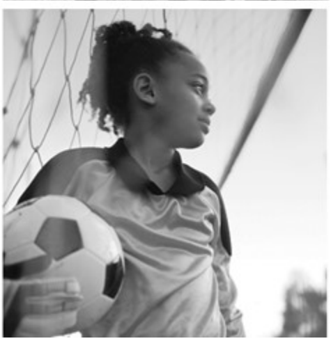
Blue Cross and Blue Shield of Montana, a Division of Health Care Service Corporation, a Mutual Legal Reserve Company, an Independent Licensee of the Blue Cross and Blue Shield Association