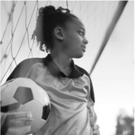
Blue Cross and Blue Shield of Montana, a Division of Health Care Service Corporation, a Mutual Legal Reserve Company, an Independent Licensee of the Blue Cross and Blue Shield Association