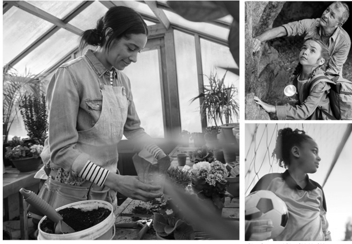
Blue Preferred Bronze PPO<sup>SM</sup> 101

Blue Cross and Blue Shield of Montana, a Division of Health Care Service Corporation, a Mutual Legal Reserve Company, an Independent Licensee of the Blue Cross and Blue Shield Association