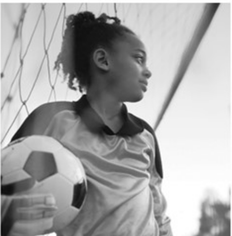
Blue Cross and Blue Shield of Montana, a Division of Health Care Service Corporation, a Mutual Legal Reserve Company, an Independent Licensee of the Blue Cross and Blue Shield Association