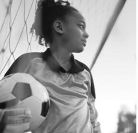
Blue Cross and Blue Shield of Montana, a Division of Health Care Service Corporation, a Mutual Legal Reserve Company, an Independent Licensee of the Blue Cross and Blue Shield Association

A health Benefit Plan approved under the Health Maintenance Organization laws of Montana.