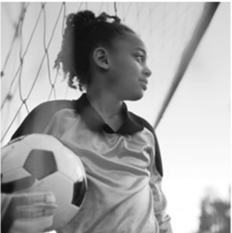
Blue Cross and Blue Shield of Montana, a Division of Health Care Service Corporation, a Mutual Legal Reserve Company, an Independent Licensee of the Blue Cross and Blue Shield Association