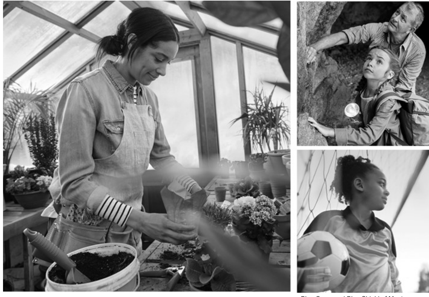
Blue Preferred Gold PPO<sup>SM</sup> 105

Blue Cross and Blue Shield of Montana, a Division of Health Care Service Corporation, a Mutual Legal Reserve Company, an Independent Licensee of the Blue Cross and Blue Shield Association