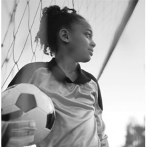
Blue Cross and Blue Shield of Montana, a Division of Health Care Service Corporation, a Mutual Legal Reserve Company, an Independent Licensee of the Blue Cross and Blue Shield Association