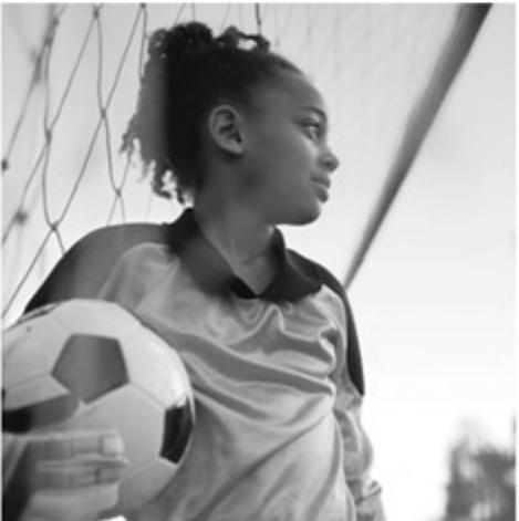
Blue Cross and Blue Shield of Montana, a Division of Health Care Service Corporation, a Mutual Legal Reserve Company, an Independent Licensee of the Blue Cross and Blue Shield Association