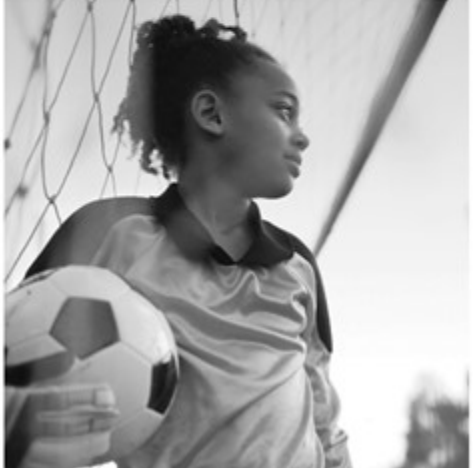
Blue Cross and Blue Shield of Montana, a Division of Health Care Service Corporation, a Mutual Legal Reserve Company, an Independent Licensee of the Blue Cross and Blue Shield Association