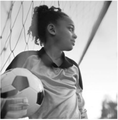
Blue Cross and Blue Shield of Montana, a Division of Health Care Service Corporation, a Mutual Legal Reserve Company, an Independent Licensee of the Blue Cross and Blue Shield Association