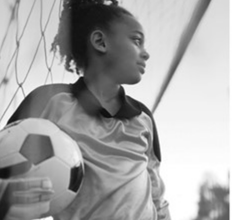
Blue Cross and Blue Shield of Montana, a Division of Health Care Service Corporation, a Mutual Legal Reserve Company, an Independent Licensee of the Blue Cross and Blue Shield Association

A health Benefit Plan approved under the Health Maintenance Organization laws of Montana.