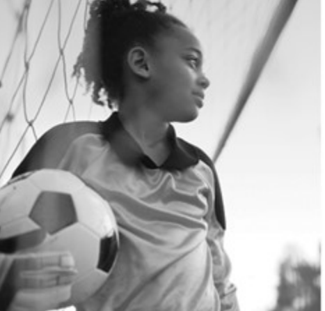
Blue Cross and Blue Shield of Montana, a Division of Health Care Service Corporation, a Mutual Legal Reserve Company, an Independent Licensee of the Blue Cross and Blue Shield Association

A health Benefit Plan approved under the Health Maintenance Organization laws of Montana.