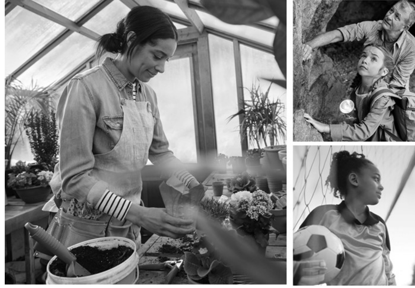
Blue Preferred Platinum PPO<sup>SM</sup> 101