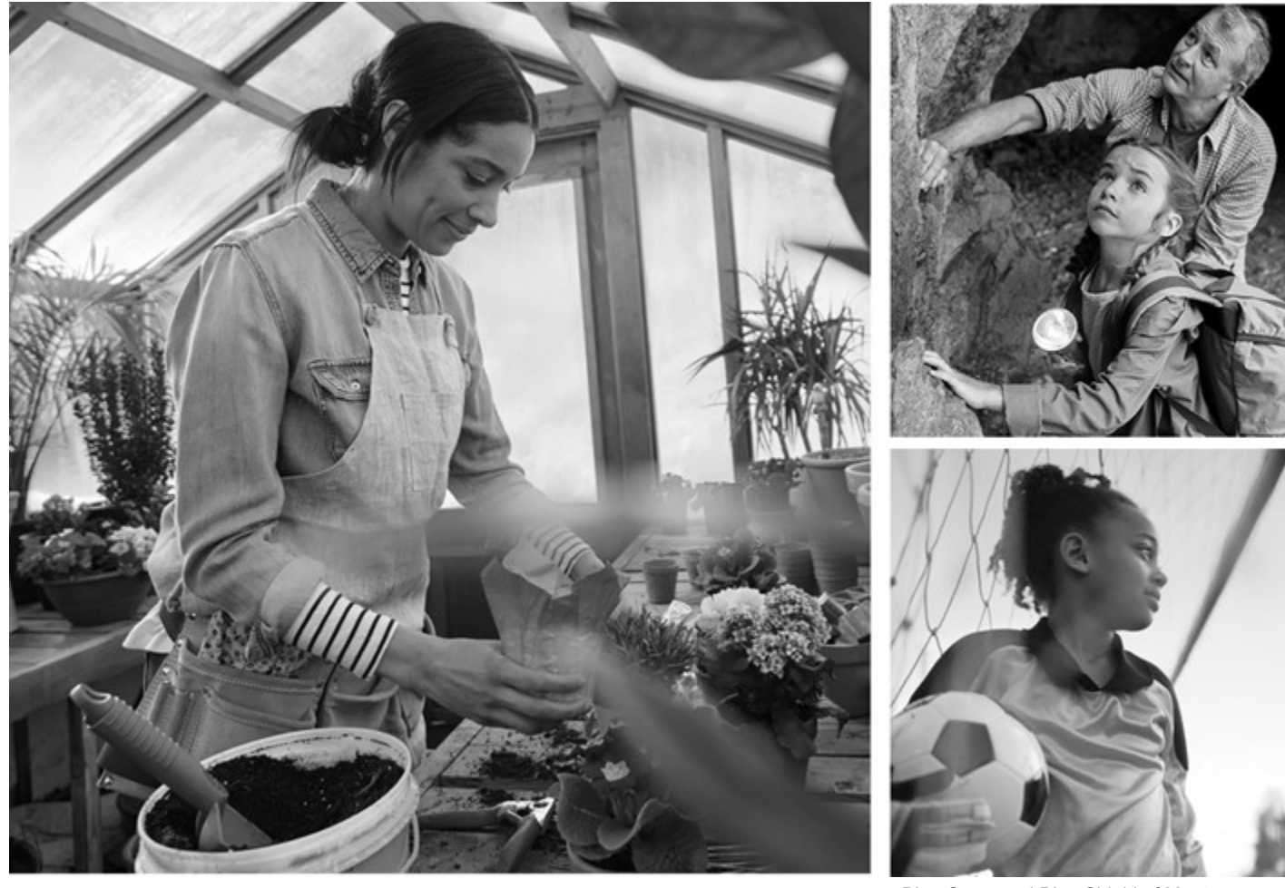
Blue Preferred Platinum PPO<sup>SM</sup> 101

Blue Cross and Blue Shield of Montana, a Division of Health Care Service Corporation, a Mutual Legal Reserve Company, an Independent Licensee of the Blue Cross and Blue Shield Association