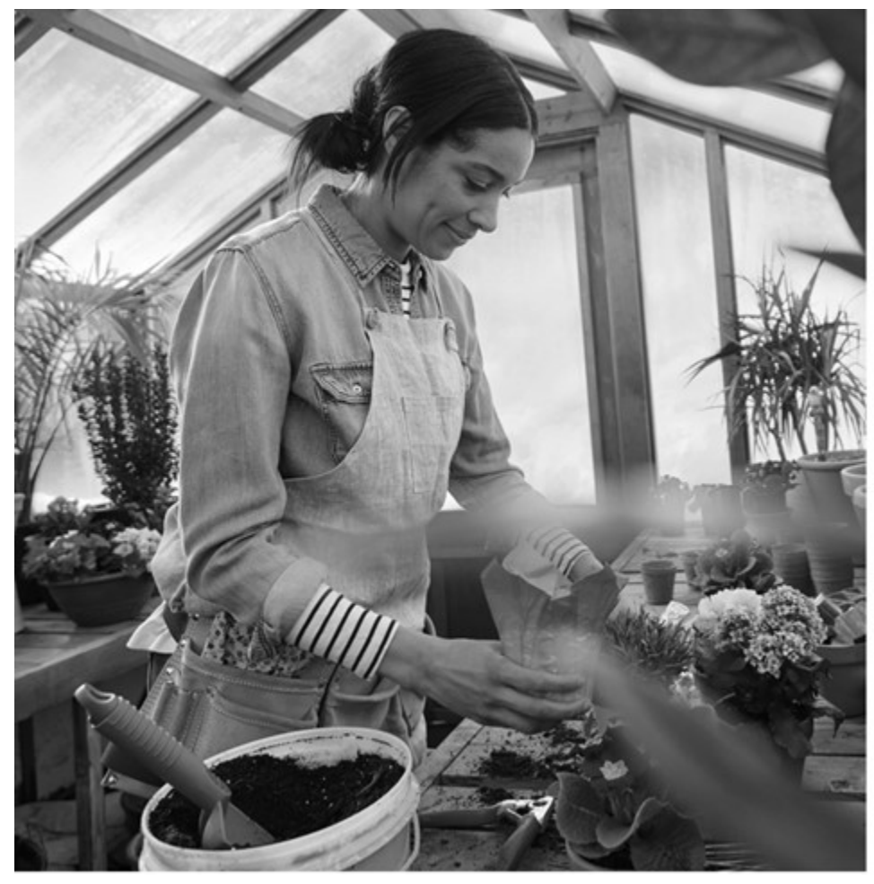
Blue Preferred Platinum PPO<sup>SM</sup> 102