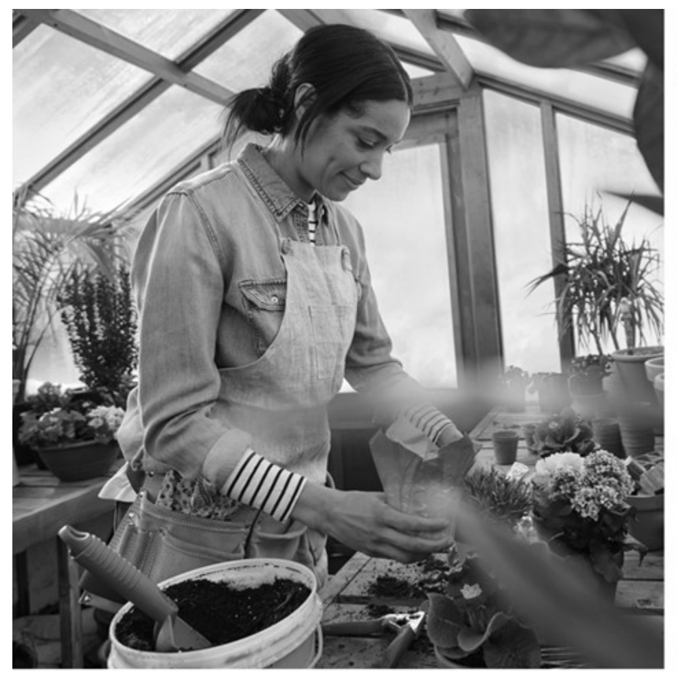
Blue Preferred Platinum PPO<sup>SM</sup> 102