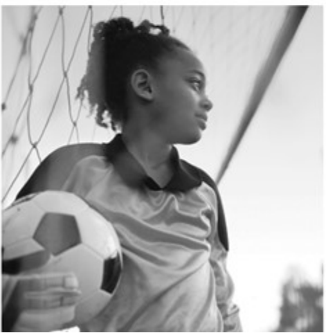
Blue Cross and Blue Shield of Montana, a Division of Health Care Service Corporation, a Mutual Legal Reserve Company, an Independent Licensee of the Blue Cross and Blue Shield Association