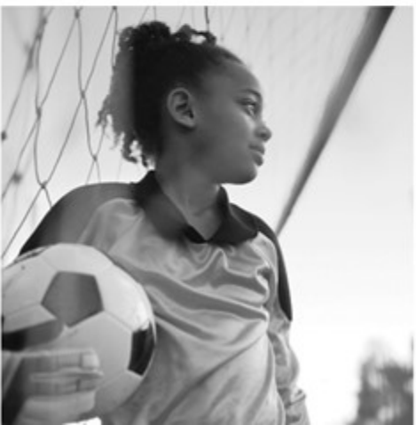
Blue Cross and Blue Shield of Montana, a Division of Health Care Service Corporation, a Mutual Legal Reserve Company, an Independent Licensee of the Blue Cross and Blue Shield Association