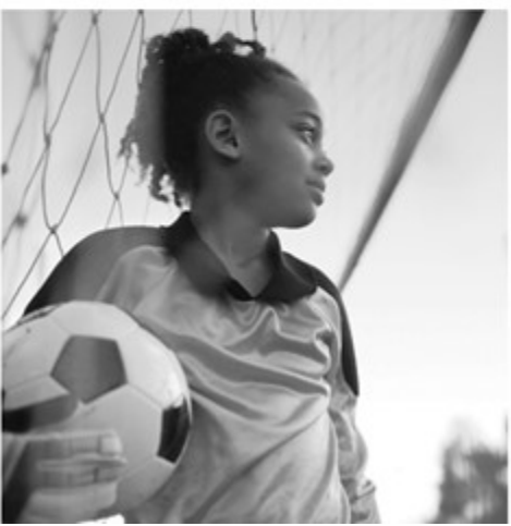
Blue Cross and Blue Shield of Montana, a Division of Health Care Service Corporation, a Mutual Legal Reserve Company, an Independent Licensee of the Blue Cross and Blue Shield Association