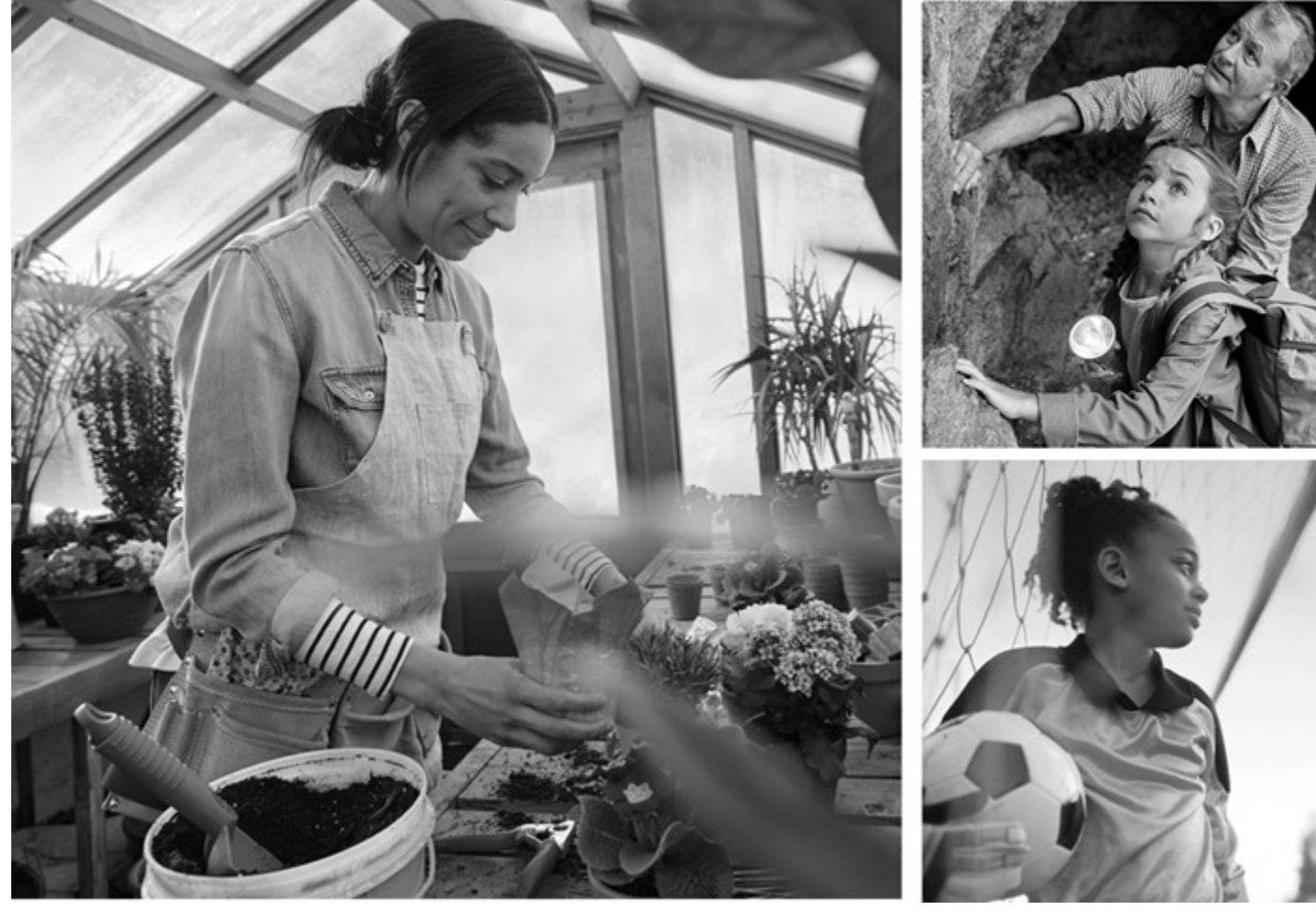
Blue Preferred Silver PPO<sup>SM</sup> 136