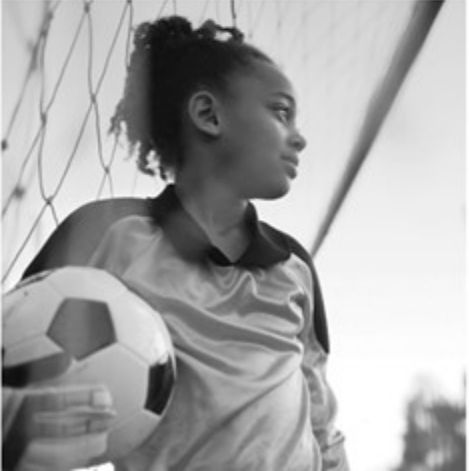
Blue Cross and Blue Shield of Montana, a Division of Health Care Service Corporation, a Mutual Legal Reserve Company, an Independent Licensee of the Blue Cross and Blue Shield Association