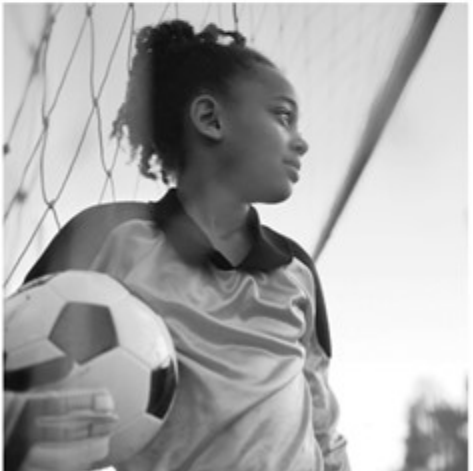
Blue Cross and Blue Shield of Montana, a Division of Health Care Service Corporation, a Mutual Legal Reserve Company, an Independent Licensee of the Blue Cross and Blue Shield Association