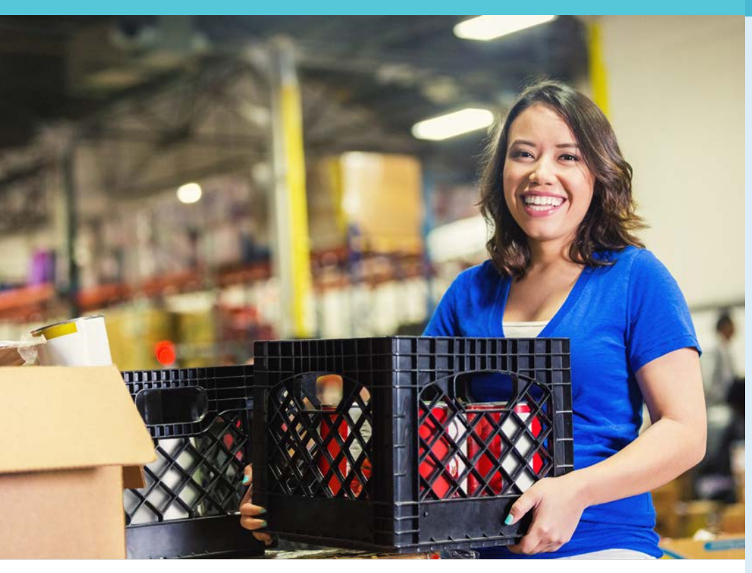
- CONTINUED FROM PREVIOUS PAGE